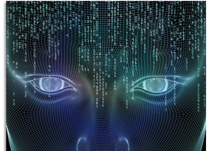
Machine Learning & AI